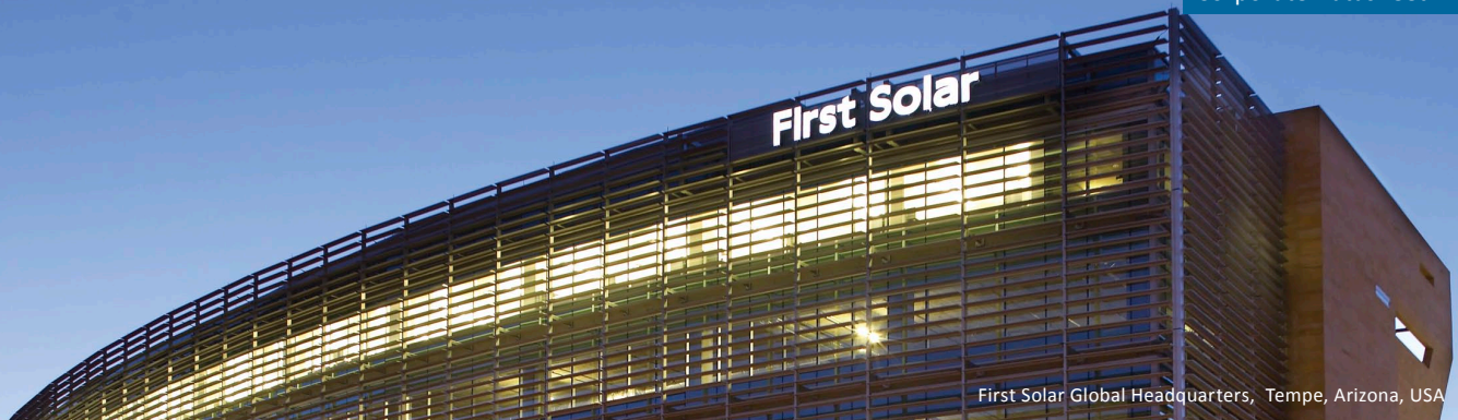
First Solar Global Headquarters, Tempe, Arizona, USA